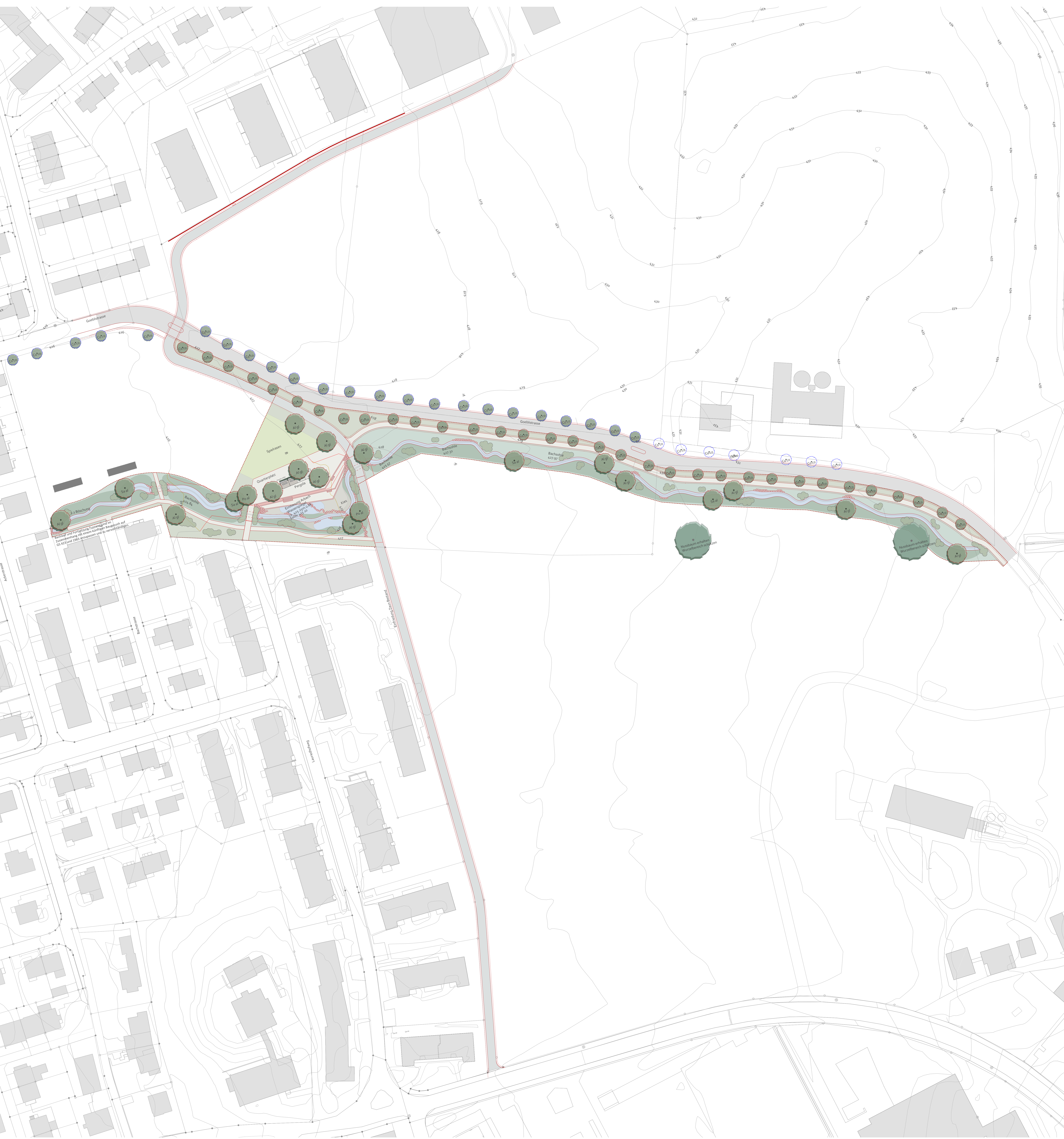
Grundriss Mst. 1:500